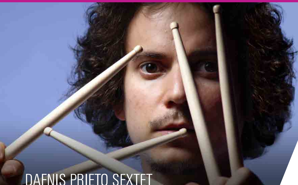
Dafnis Prieto