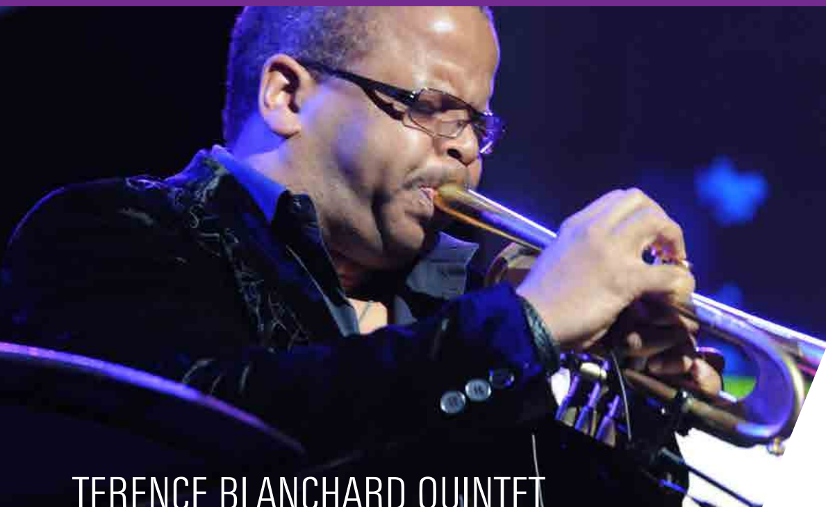
Terry Blanchard